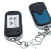
250 Remote Control