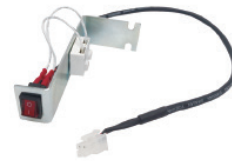
250 Power Cable